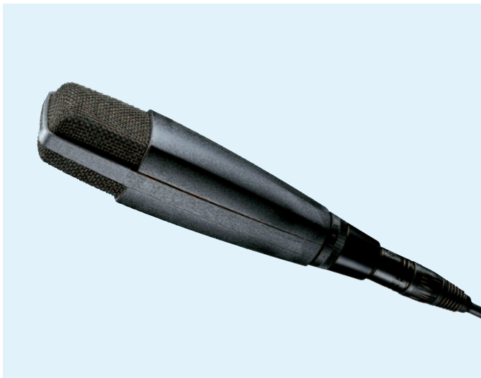
Cable pictured is an accessory not supplied with the microphone

The MD 421 II is one of the best known microphones in the world. Its excellent sound qualities enable it to cope with the most diverse recording conditions and broadcasting applications. The five position bass control enhances its 'all-round' qualities. Colour: black.