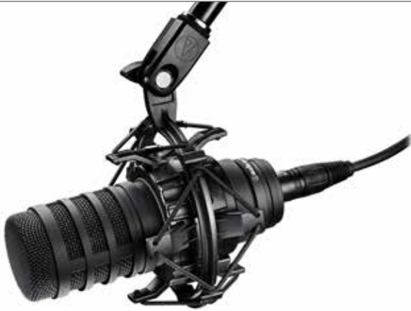
AT8484 Shock Mount (optional accessory)